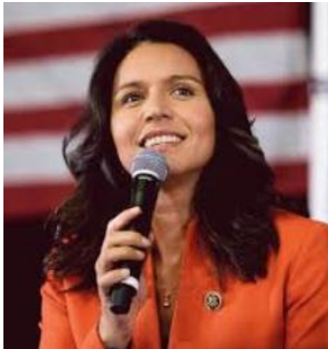
Tulsi Gabbard, Democrat presidential candidate

The Tulsi Gabbard presidential campaign has filed a major lawsuit against Google. This article outlines the main points of the lawsuit and evidence that the social media giant Google has quietly acquired enormous influence on public perceptions and has been actively censoring alternative viewpoints.