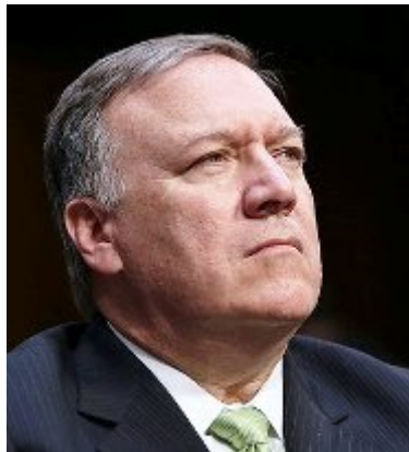
Mike Pompeo -- LIAR

I discovered in the media today that my in-grown toenail was caused by Iran, isn't that right Mike? Furthermore, I had a severe attack of acid-stomach after eating out, and I 'know' that Iran was again responsible because John Bolton told me so; I mean really, you would think that neocon war mongering, TRANSPARENT, Washington buffoons could do better, but they can't.