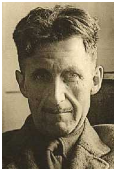
George Orwell, Prophet

The population has become accustomed to losing most of its civil liberties and inalienable rights over the past two decades so what would it matter if it loses them ALL, as surely no-one is going to do anything constructive about restoring our lost freedoms and liberties. Amazing, I managed to write the introductory first sentence without mentioning Big Brother!